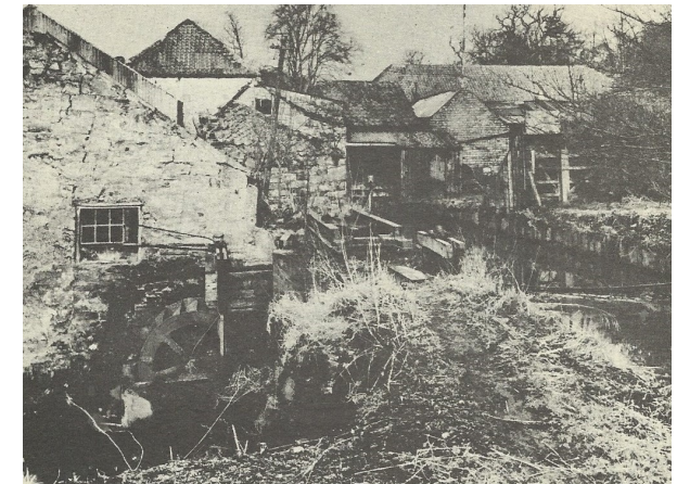
Note — Peggies Mill continued below.

Peggies Mill before demolition, in 1966.