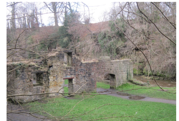
Ruin of Fair a Far Mill 2013.

This was a former corn mill operated by the Cramond Estate as part of their Fair a Far Farm operations. It was purchased at the same time as Cockle Mill (1752) but was not converted to iron working until 1759. The shell of the main building still survives along with traces of the adjoining buildings. The millhouse has scrape marks on the south wall (said to be from the mill wheel). The mill wheel was water driven and geared to a smaller wheel, the axle then entered through the wall to drive the tilt hammer and grindstones.