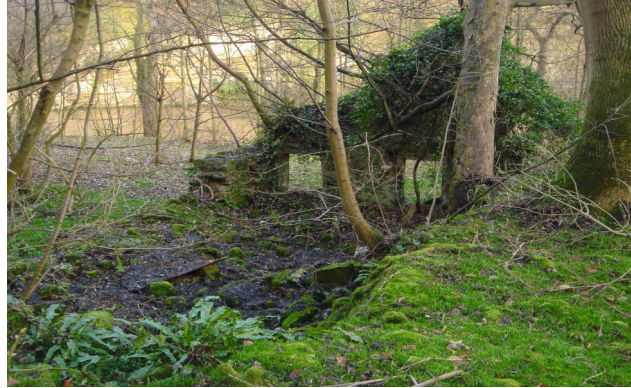
Remains of Craigie Mill (2013).

from his mill operations". His claims were not upheld by the Court and his interests in the mill gave way to quarrying nearby (see section (6) below).