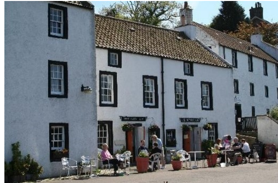
Cramond Village at the riverside.

This is open throughout the summer months, from April to October, 14.00— 16.00hrs (Sat & Sun) and daily during the Edinburgh Festival. Here you will find a good range of information about the village, and its environs, since the date of the Roman occupation (next to the café).