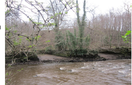
Craigie Quarry Loading Bays 2013 >>>

These bays were constructed to enable stone from the Craigie Quarry to be loaded on to barges for shipping to Leith Docks where it was then transferred to other transport. Much of the stone was bound for the Edinburgh 'New Town' developments, with the balance being shipped to other destinations.