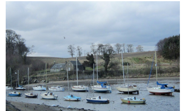
Below, a typical summer scene at Cramond.

Cramond Village and the site where the Roman Lioness sculpture was found, in 1997, lies ahead of the Boat Club (there is a good information board at the site). The Lioness sculpture can be seen in the National Museum of Scotland.