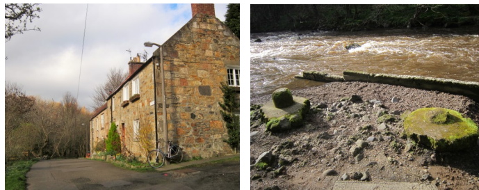
Dowie's Mill Cottages and the riverside ruins (2013)

Spade making became one of the Cramond Iron Company's great specialities during the 18 th century and it was during this time that Dowie's employed a colony of nail makers. At a later date the mill was operated as a saw mill and timber production unit for Cadell.