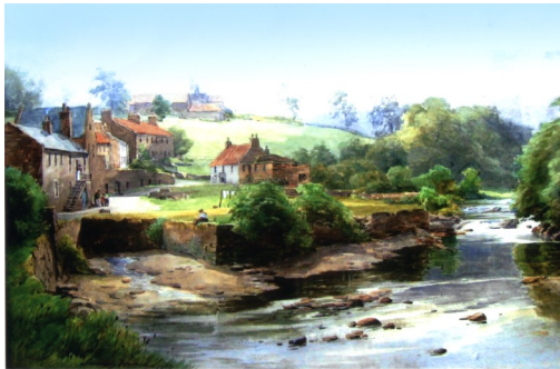
1896 Water Colour of Cockle Mill

This is thought to be the site of the oldest mill in the area and was in the possession of the Bishops of Dunkeld, who owned Cramond Tower and had their Abbey at Inchcolm, in 1179.